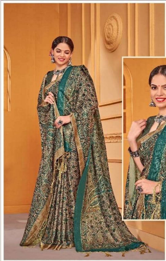
I didn't try and do fashion pictures. I tried to do portraits of girls wearing Sarees. David Bailey