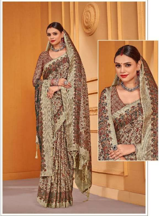
"A girl should be two things: classy and fabulous." Coco Chanel