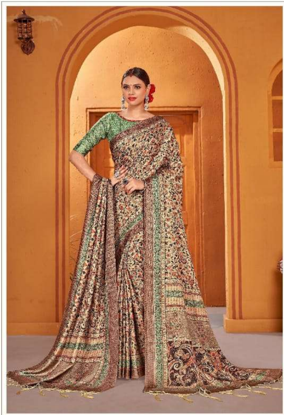
When art Sarees in worn-out material It is most easily recognized as art. Friedrich Nietzsche