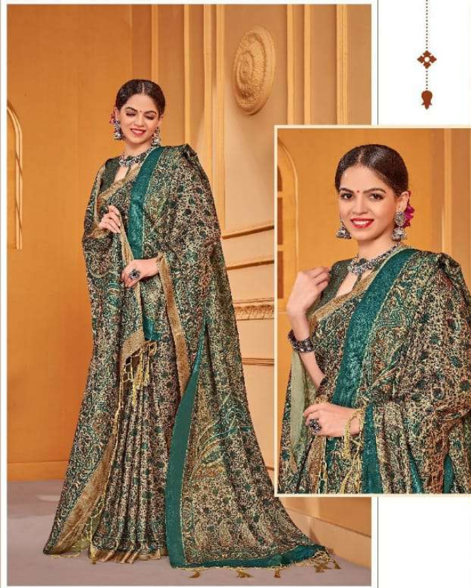
I didn't try and do fashion pictures. I tried to do portraits of girls wearing Saresses. David Bailey