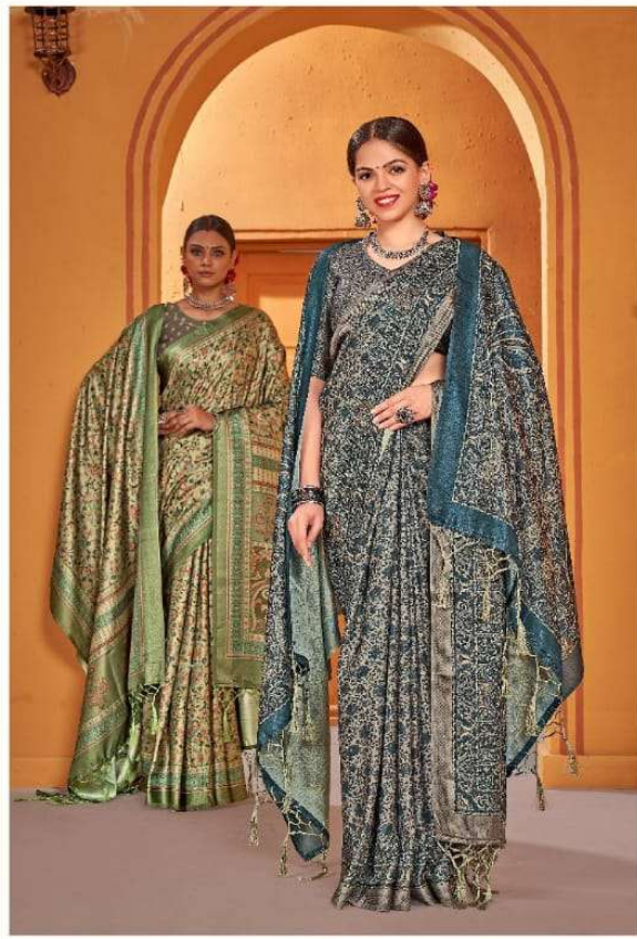
When art Saresses in worn-out material It is most easily recognized as art. Friedrich Nietzsche