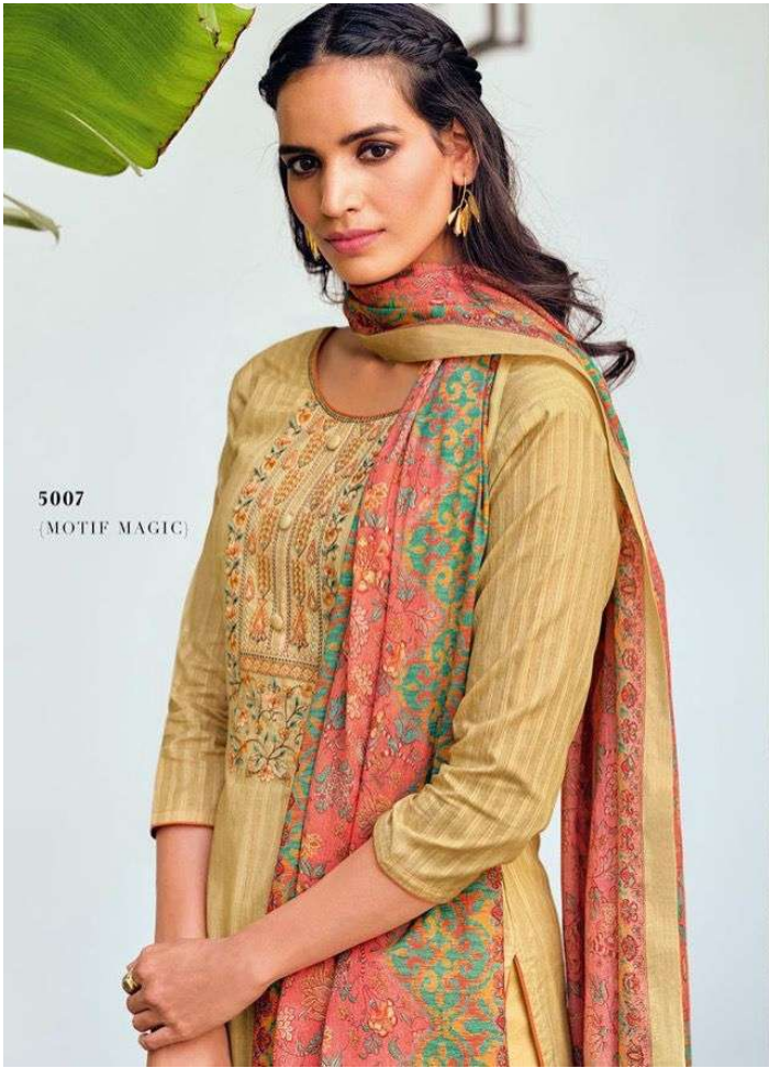
5007 (MOTIF MAGIC)