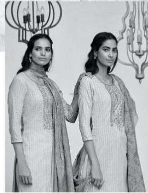
{FABULOUS AT EVERY AGE}