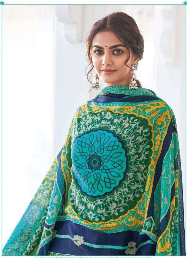
The ethnic elements of Indian Fashion from traditional motifs to contemporary material make it different from regional culture.