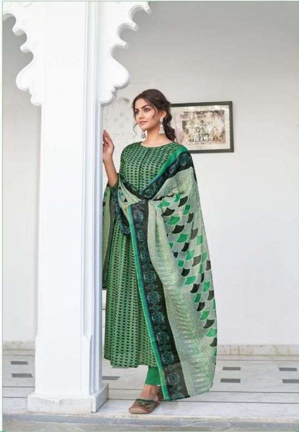
The ethnic essence of Indian Fashion from traditional motifs to a contemporary aesthetic. In this collection, we've infused regional culture.