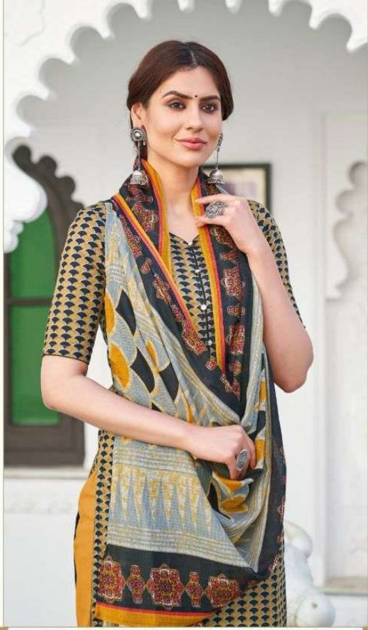
The ethnic patterns of Indian Fashion form traditional motifs to contemporary designs. Here, it's all about vibrant geometric colours.