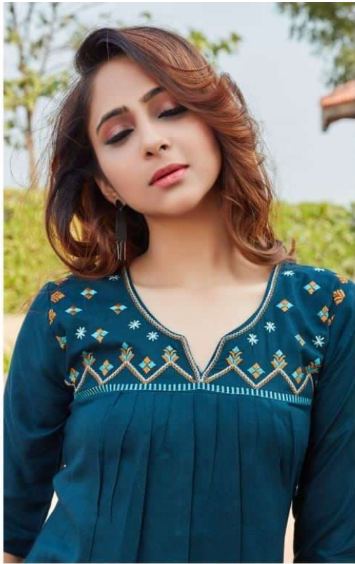
CREAM OF THE CROP