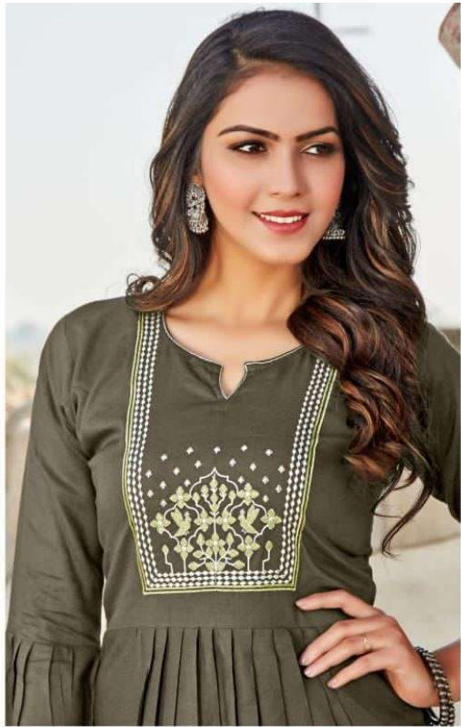
CREAM OF THE CROP