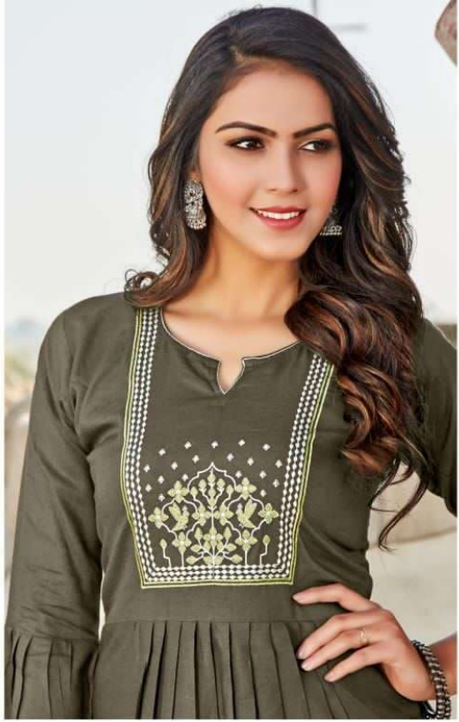
CREAM OF THE CROP