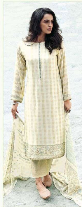
SY : Ø3