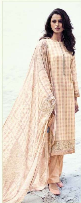
SY : Ø2