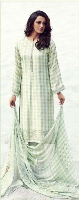
SY : Ø11