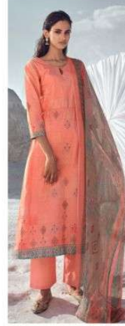
• 1945 •