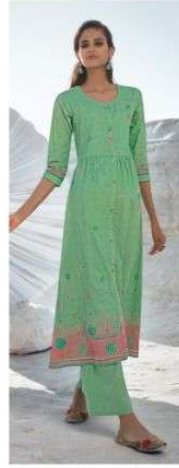
• 1944 •