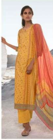
• 1943 •