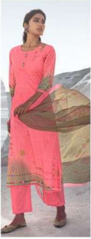
• 1941 •