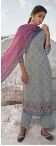
• 1942 •