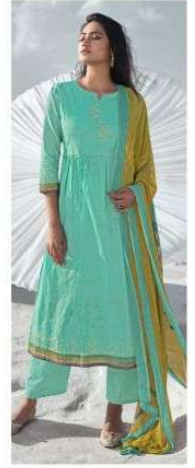
• 1946 •