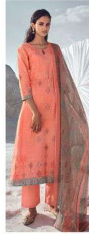
• 1945 •