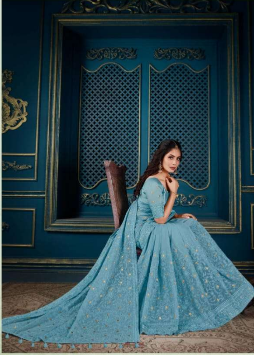
05 We're feeling beauty this winter with amazing design and pleasing colours promise to get us in the mood, in a single bound