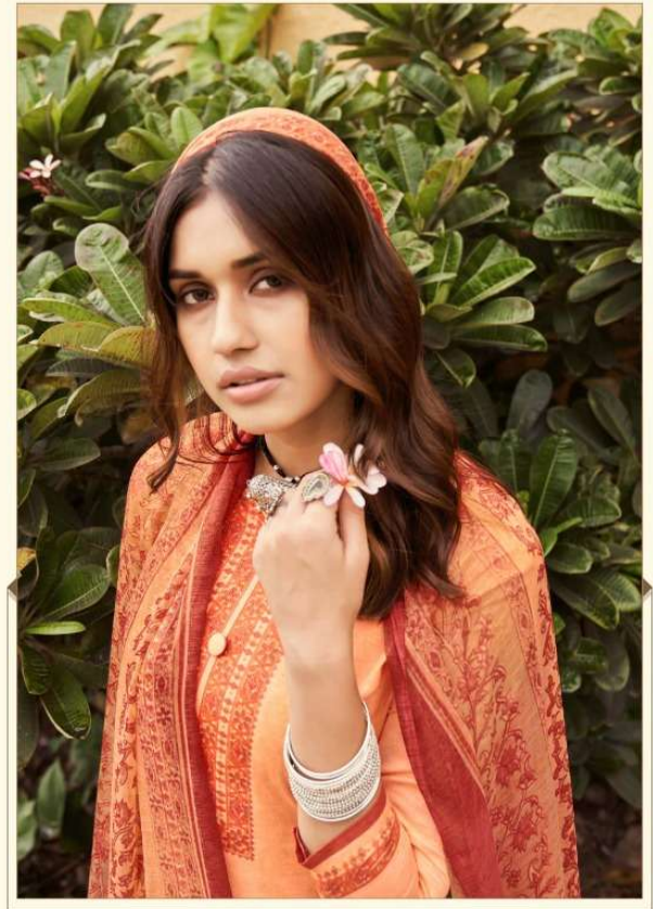
Mirai Mirai is one of the strongest fabric collections of the season and has elegant and fashion is more affordable and easier to wear. 1018-005