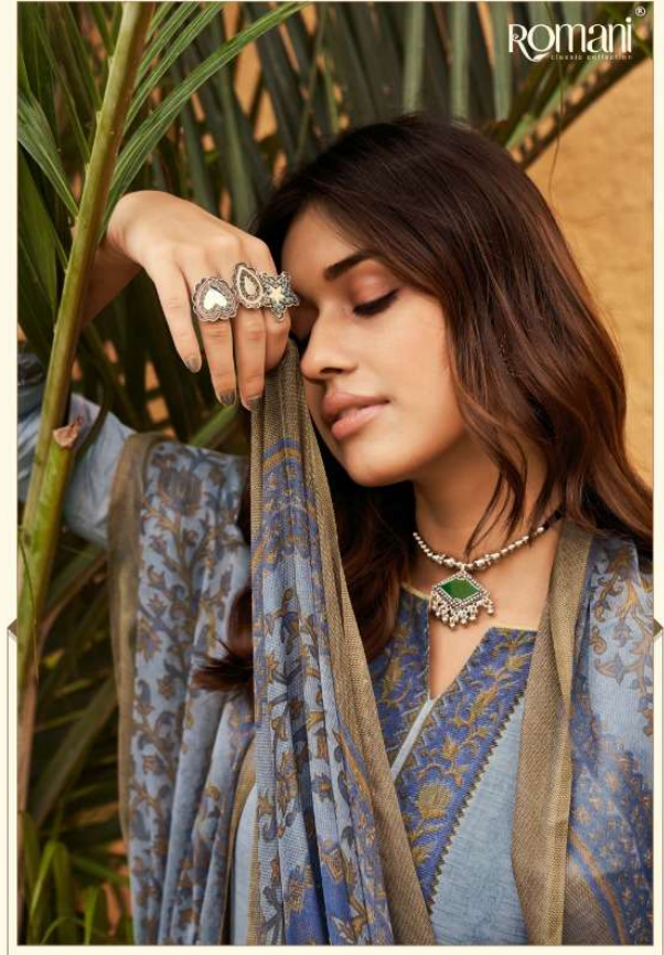
Mirai Single colour is one of the original forms in design of the Indian and both elegant and appeal to most ethnic and ethnic style. 1018-006