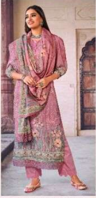
D NO. : 56001