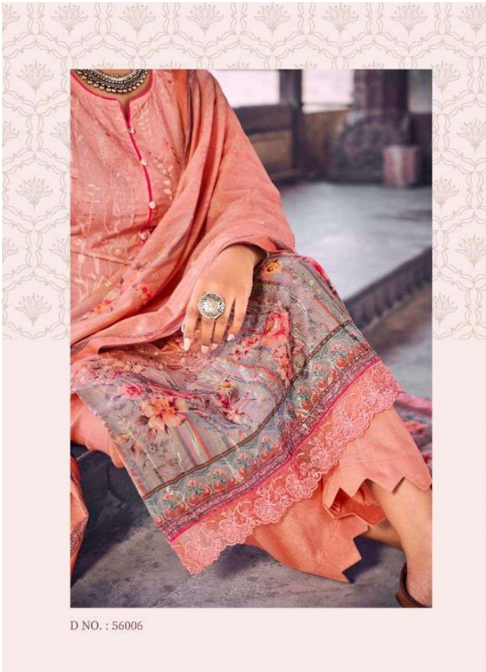
D NO. : 56006