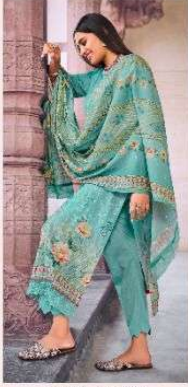
D NO. : 56002