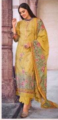
D NO. : 56003