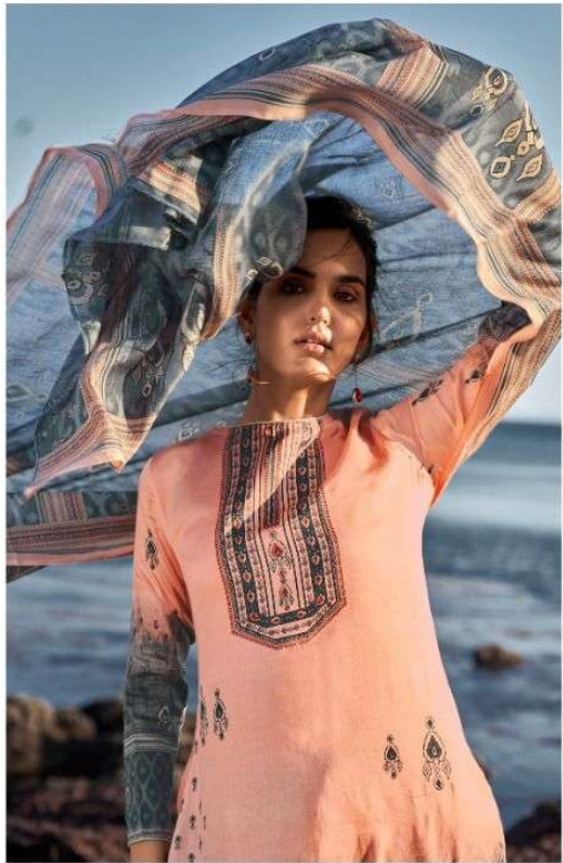
GARMENT STYLE 1004