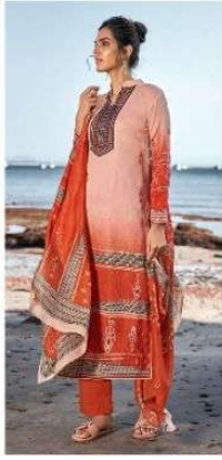
GARMENT STYLE 1001