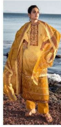
GARMENT STYLE 1003