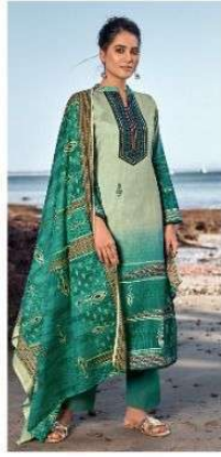
GARMENT STYLE 1002