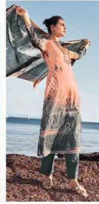
GARMENT STYLE 1004