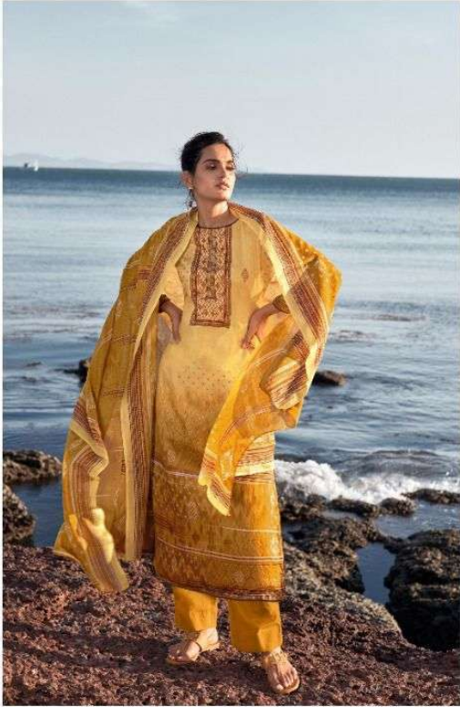
GARMENT STYLE 1003