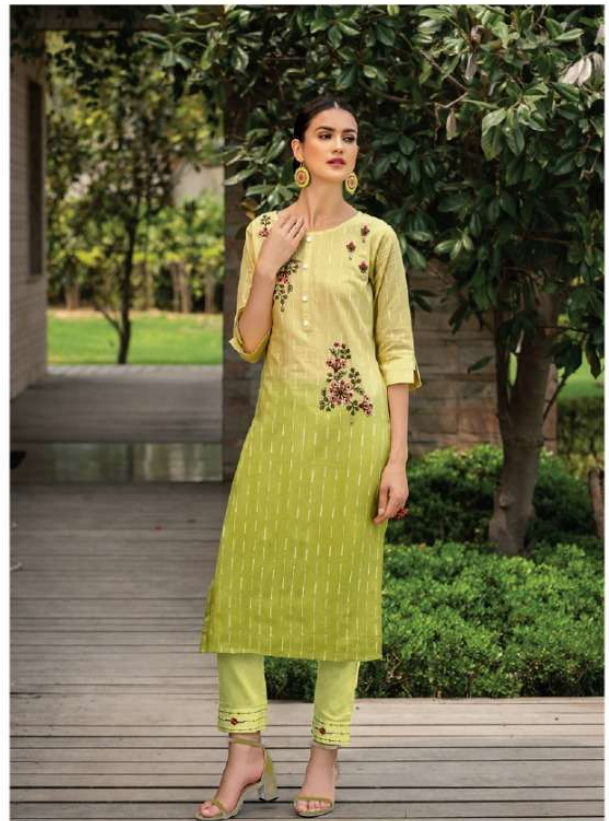
TOP: Soft Cotton with Long Slub Shaded with Embroidery