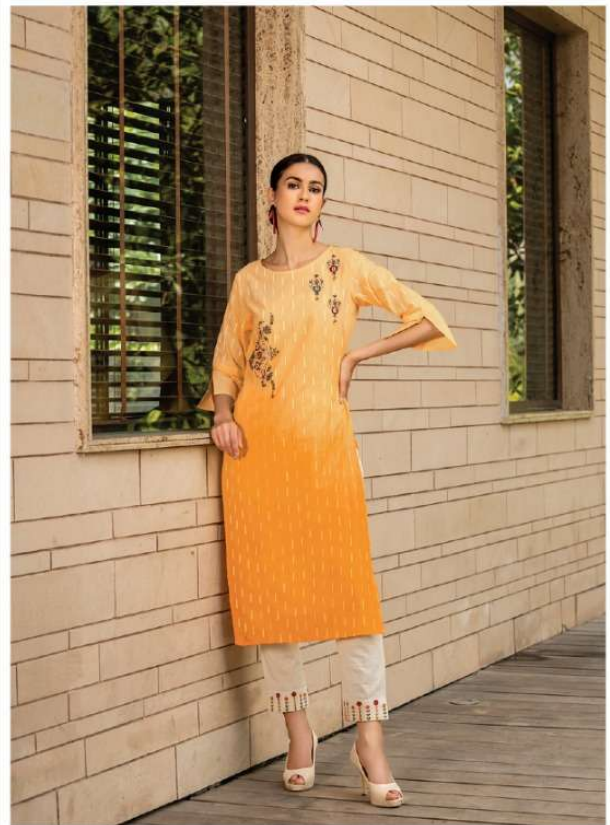
TOP: Soft Cotton with Long Slub Shaded with Embroidery