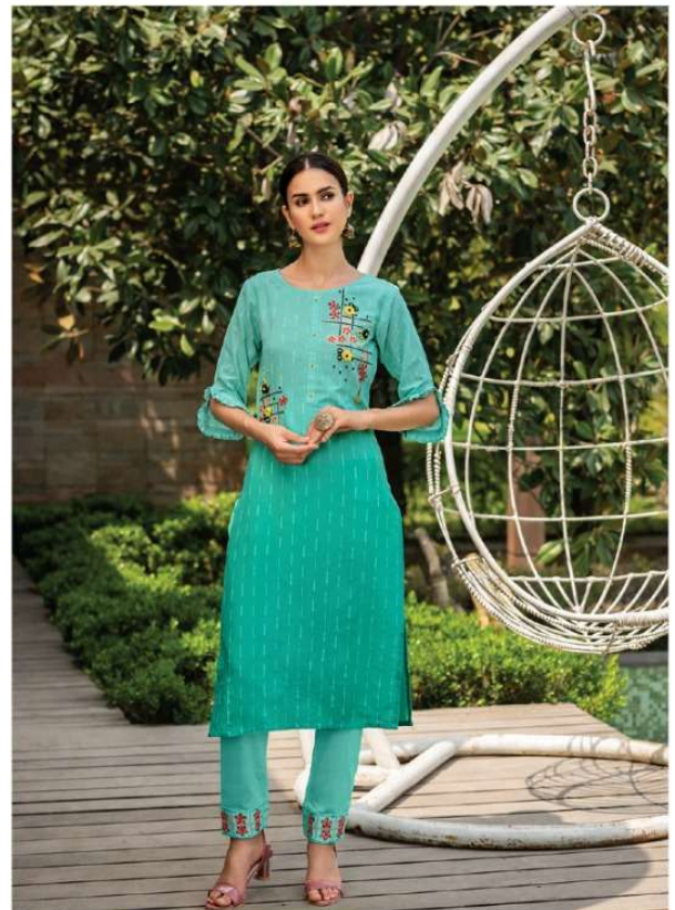
TOP: Soft Cotton with Long Slub Shaded with Embroidery