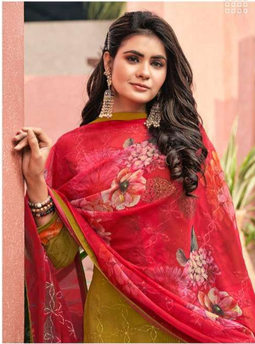
□□□□ Luxe fabrics, bold patterns & sumptuous detailing ADORN MODERN SILHOUETTES. 3571