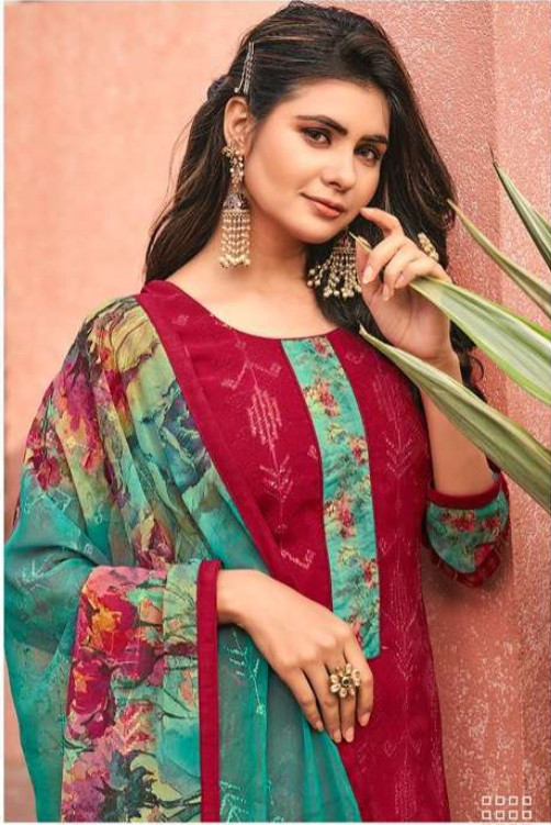
Patterns & prints to blend into an easy draped silhouette in soft SENSUAL FABRICS.