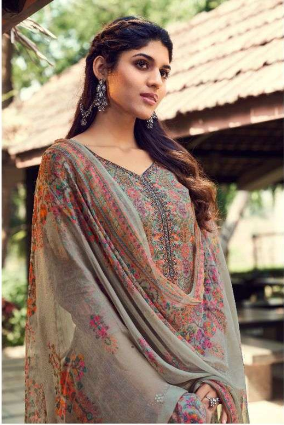
An ethnic and ethnic look in a contemporary design and look. It is a mix of traditional and modern.