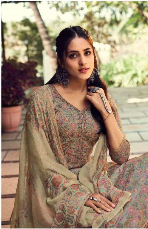
These dresses are to come a little in the market. It is a design and fabric style. 28001