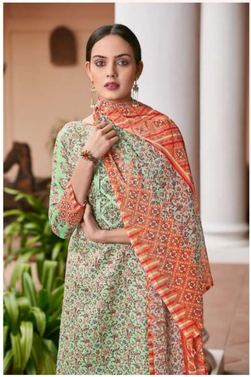
DESIGN - I 732 006 FASHION IS ABOUT SUSPENSE AND SURPRISE AND FANTASY