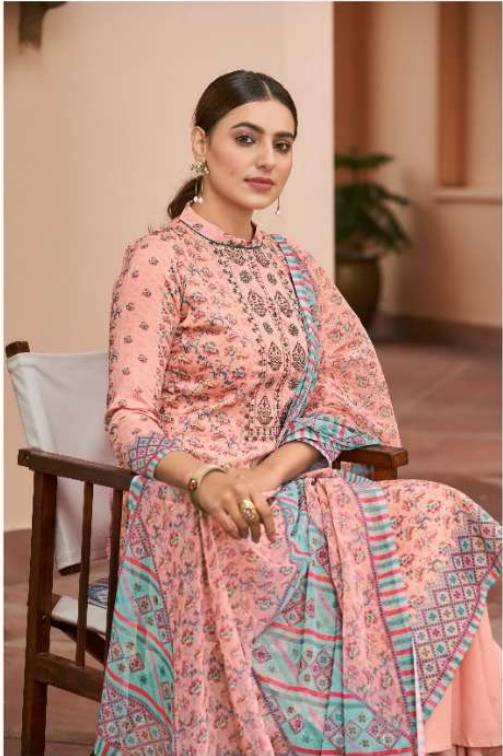
DESIGN - F-732 001

THE CITY IS IN CONTRAST TO THE COUNTRY'S SO YOU DON'T END UP BEING THE FEMININE QUOTIENT