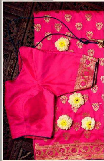
100% SILK PAITHANI, PALLU, SAREE WITH SWAROVSKI STONES ON IT. HAVING DOUBLE BLOUSE CONCEPT. FIRST SILK BLOUSE AND SECOND RAWA EMBROIDERED BLOUSE.