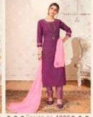
••• Design no. 1006 •••