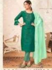
••• Design no. 1007 •••