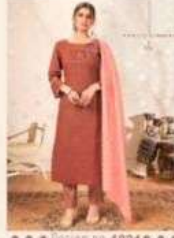
••• Design no. 1004 •••