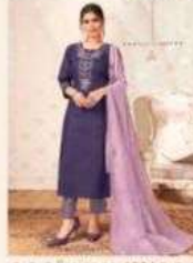
••• Design no. 1001 •••