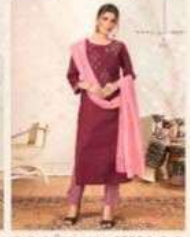
••• Design no. 1003 •••