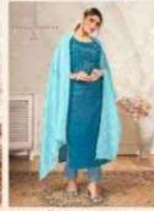
••• Design no. 1002 •••