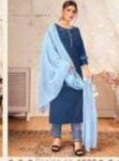
••• Design no. 1008 •••