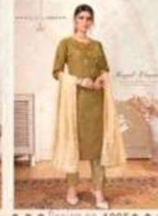
••• Design no. 1005 •••