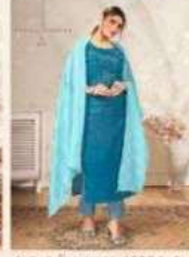
••• Design no. 1002 •••