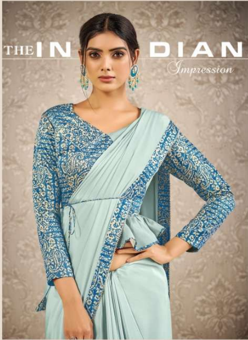
A mix of paisley and block print motifs in preham styled blouse in soft blue shades