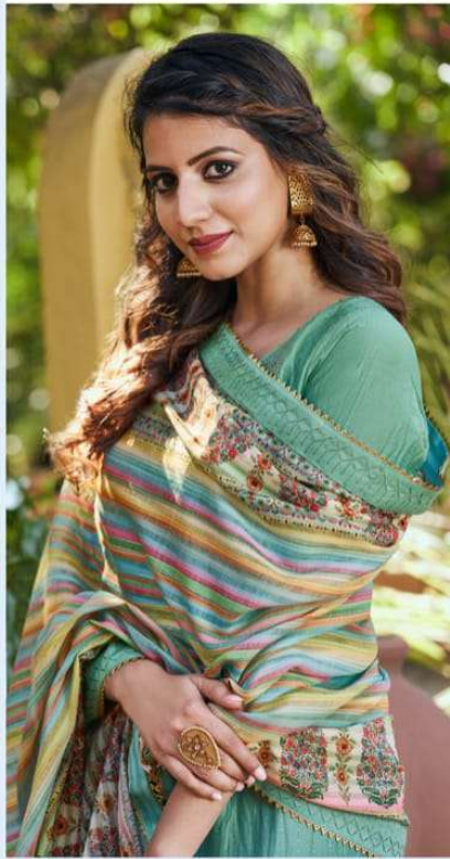
The contemporary design for the fashion conscious woman while preserving the traditional art and culture of India.