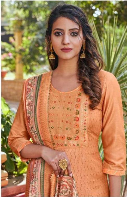
Classic styles with luxurious soft fabrics are highlighted by elegant and feminine details.