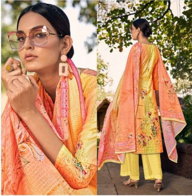
GARMENT STYLE 19002