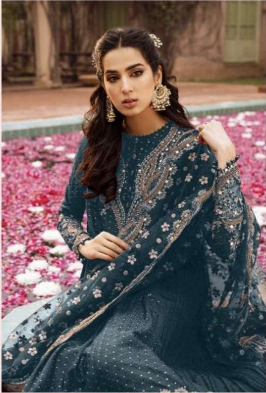
ST-1050 Color Edition