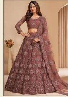
# 1004- I