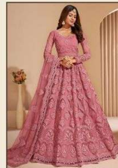
# 1008- G