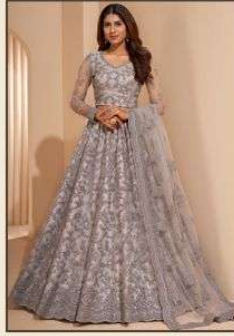
# 1001- G