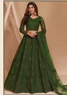
# 1006- G