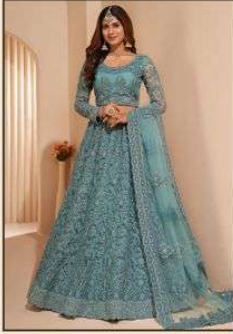
# 1003- F