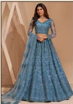
# 1007- F