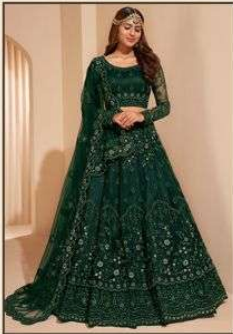
# 1005- F