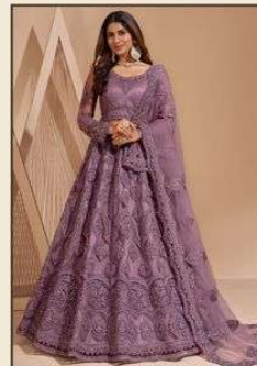
# 1008- F