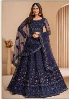
# 1005- G