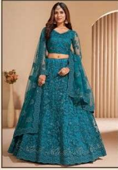
# 1001- F