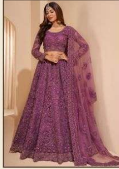
# 1003- G