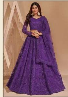
# 1006- F