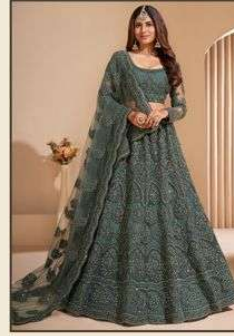
# 1002- F