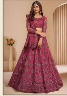
# 1004- H