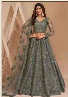
# 1007- G