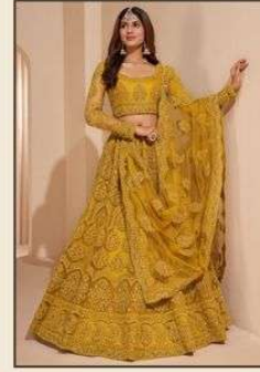
# 1002- G