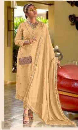
2171 - L