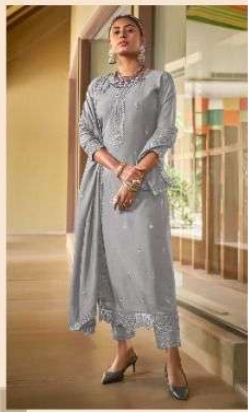
2173 - L