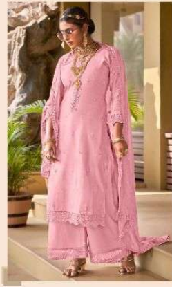
2170 - L