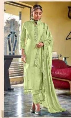
2175 - L