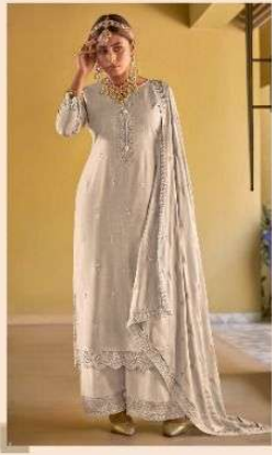
2169 - L