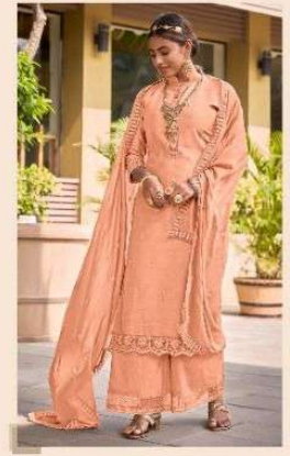
2172 - L