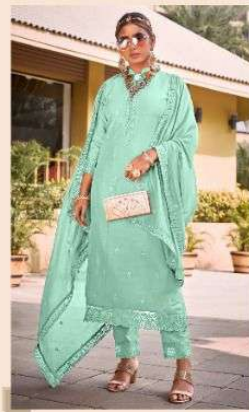
2174 - L