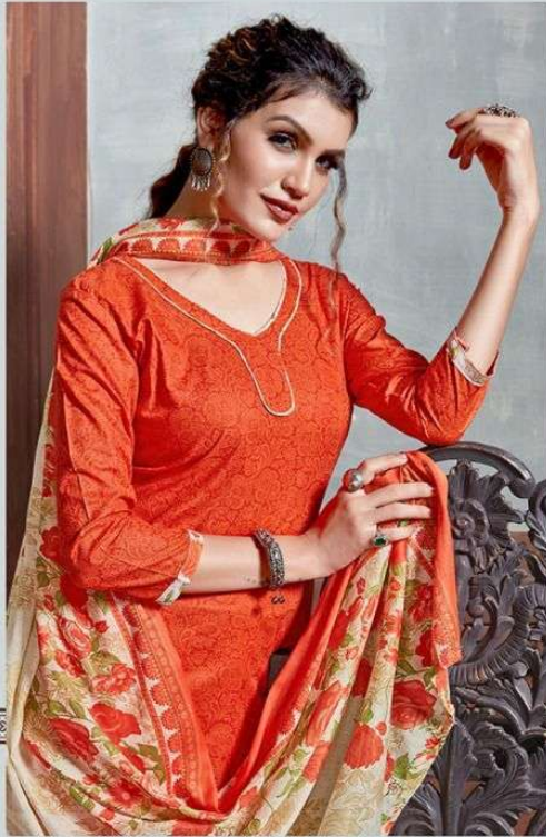
A GLITTERING AFFAIR Feel like a non-classical princess, with a touch in Indian!