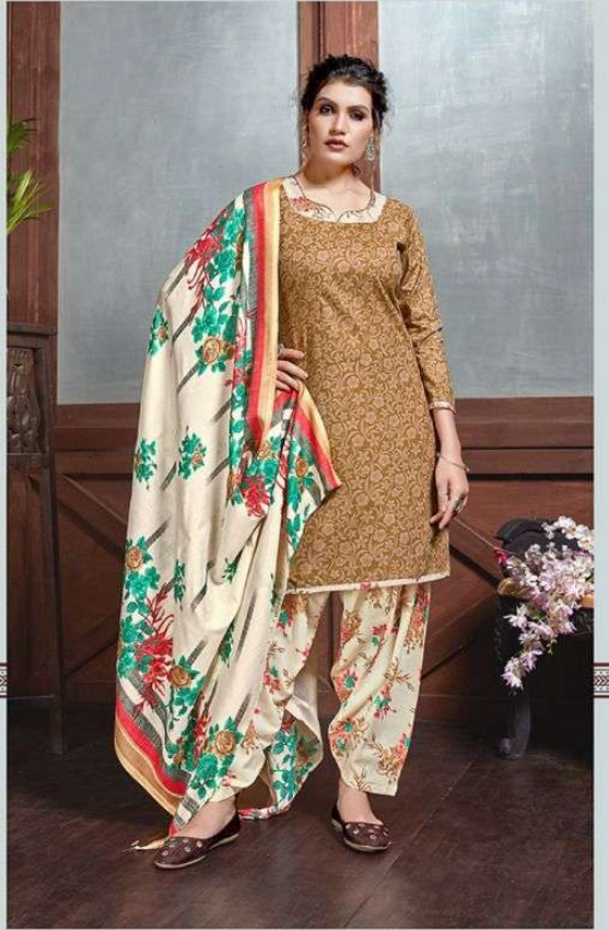
As Designers infuse their collection with their signature style, explores between fashion and class