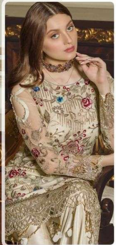
D.NO.108 FABRIC DETAILS: TOP:- NET DUPATTA:- NET INNER:- SANTOON BOTTOM:- SANTOON