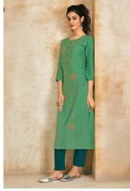
CODE | 3242