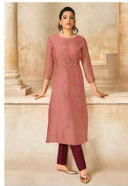
CODE | 3244