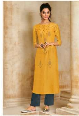
CODE | 3247