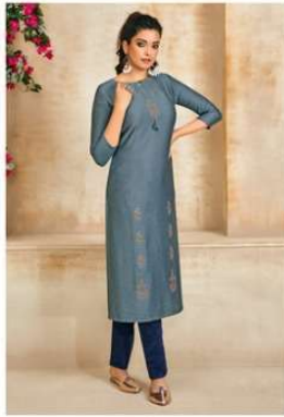
CODE | 3243