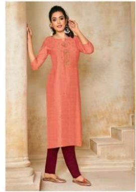
CODE | 3248