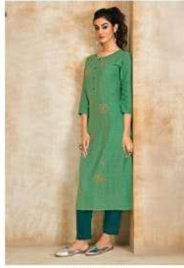
CODE | 3242