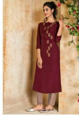
CODE | 3245