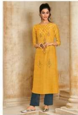
CODE | 3247