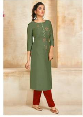
CODE | 3246