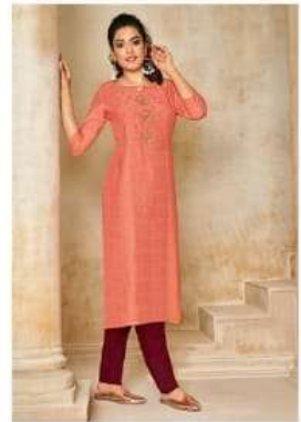
CODE | 3248