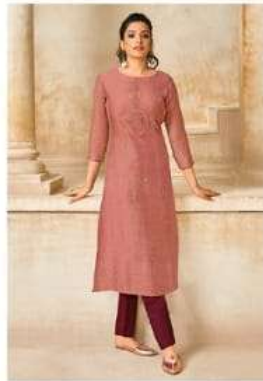
CODE | 3244