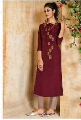
CODE | 3245