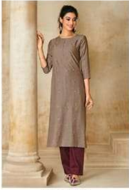
CODE | 3241