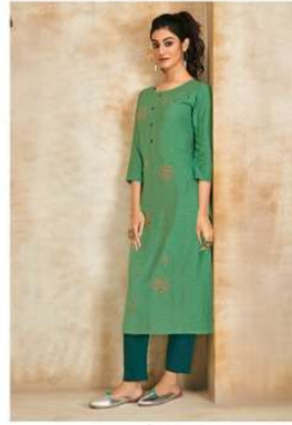
CODE | 3242