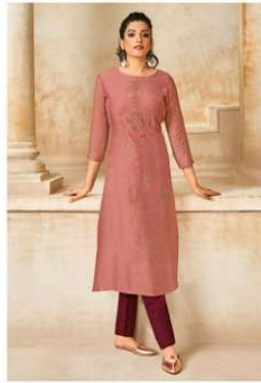
CODE | 3244