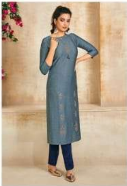
CODE | 3243