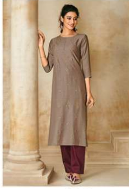
CODE | 3241