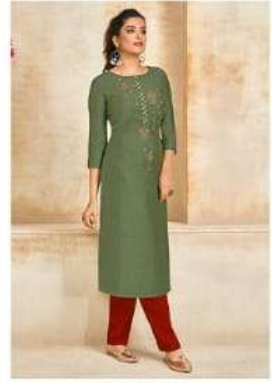
CODE | 3246