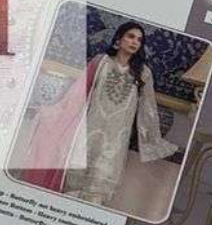
The - Beautiful and heavy embroidered Kurti - Kurta - Shalwar - Kameez Available in - White & Pink