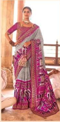
R-108 A (EMB-BR-BP)