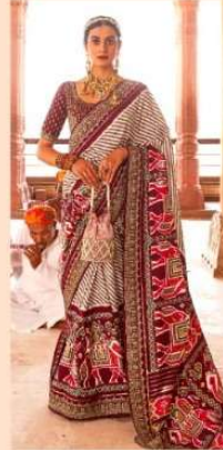
R-108 F (EMB-BR-BP)