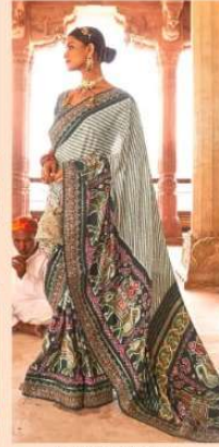
R-108 E (EMB-BR-BP)