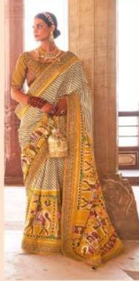
R-108 C (EMB-BR-BP)