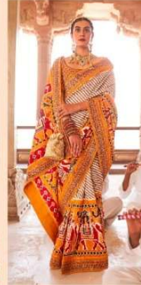
R-108 G (EMB-BR-BP)