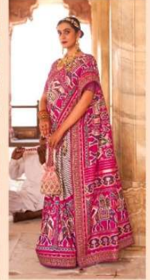
R-108 I (EMB-BR-BP)