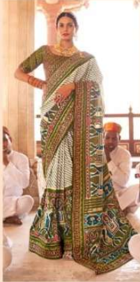
R-108 B (EMB-BR-BP)