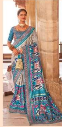
R-108 D (EMB-BR-BP)