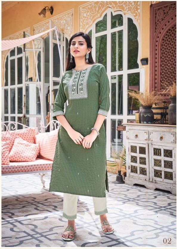
If you are someone who likes to re-define yourself and your identity in fashion, this is the right piece for you.