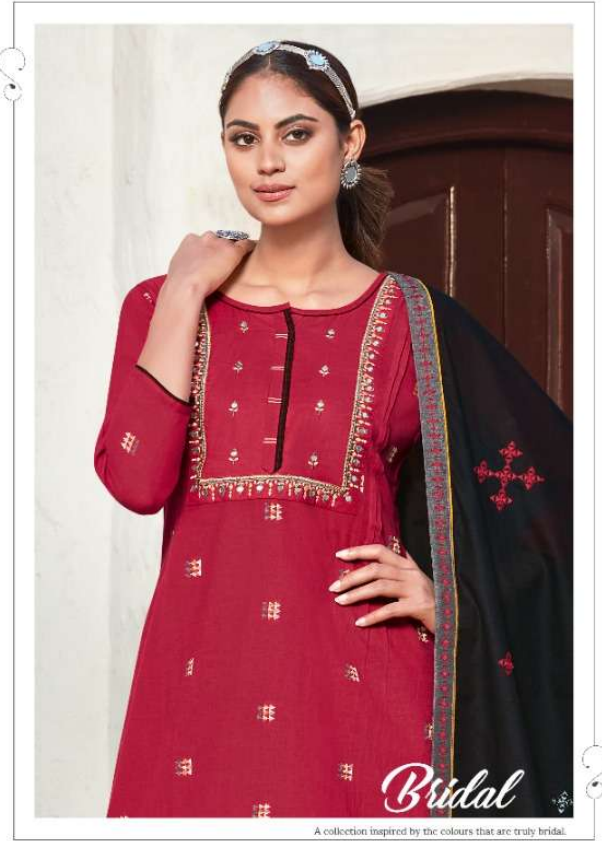
A collection inspired by the colours that are truly bridal.