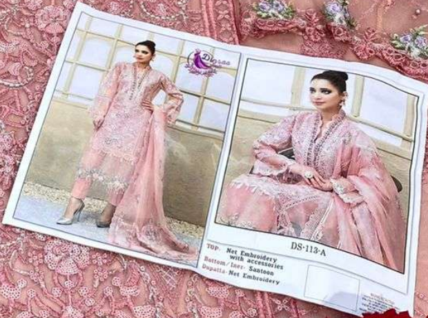
DS-113-A TOP: Net Embroidery with accessories Bottom: Linc. Satin Dupatta: Net Embroidery