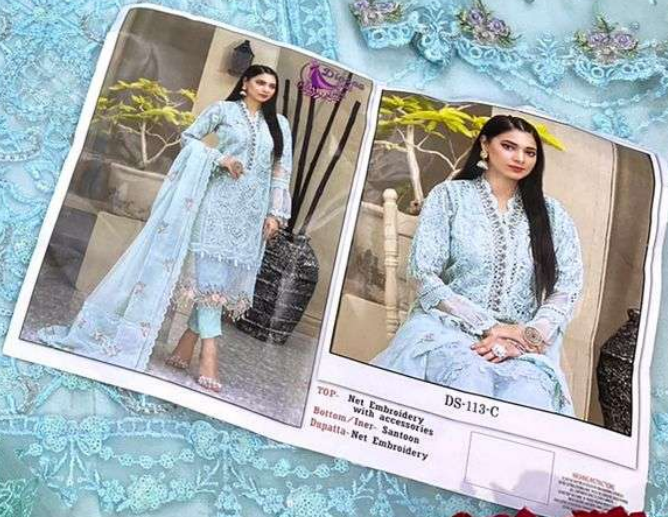
TOP: Net Embroidery Bottom/Inse: Santoon Dupatta: Net Embroidery DS-113-C