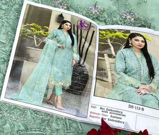
TOP: Net Embroidery with accessories Bottom / Inner: Satin Dupatta: Net Embroidery