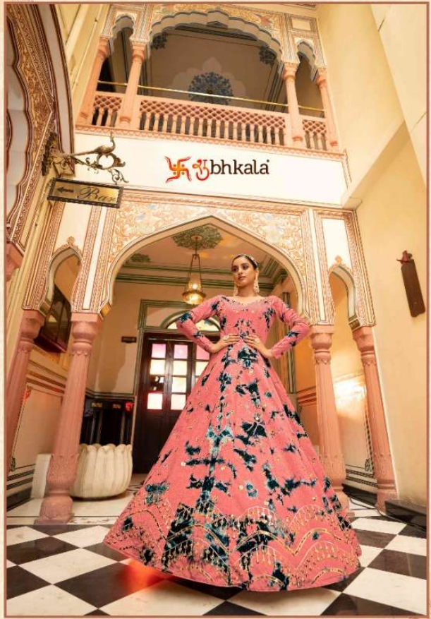
"Fashion is only the attempt to realize art in living forms and social intercourse."