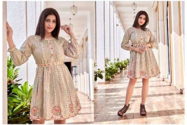
| D.NO.5809 |