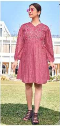
| D.NO.5806 |