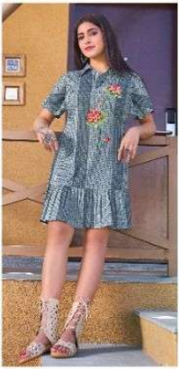
| D.NO.5804 |