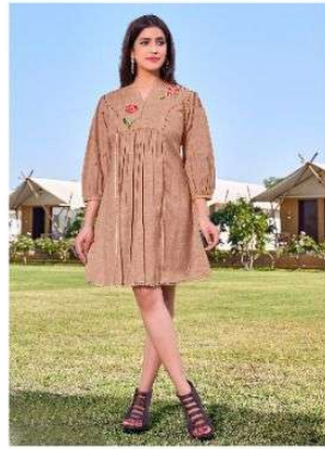
| D.NO.5807 |