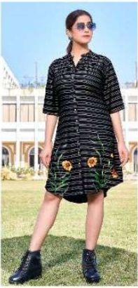
| D.NO.5803 |