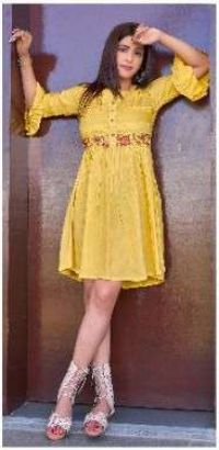
| D.NO.5805 |