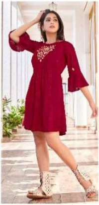
| D.NO.5801 |