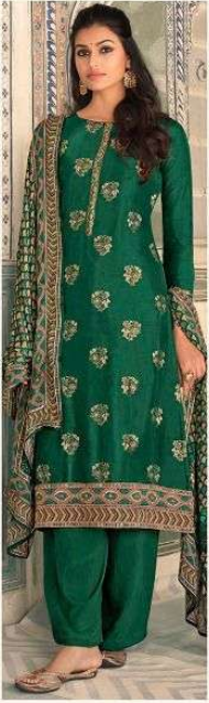
• 7981 •