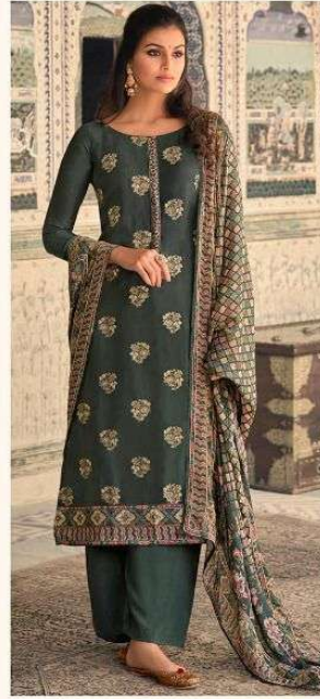
• 7984 •