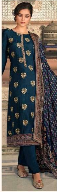
• 7983 •