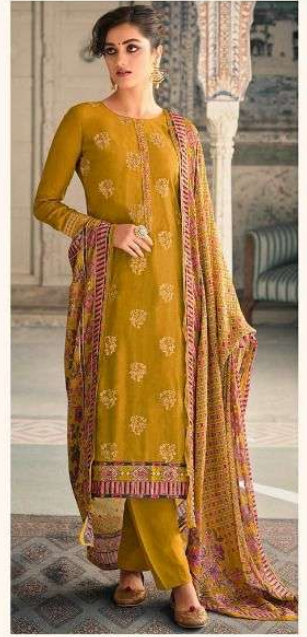
• 7985 •