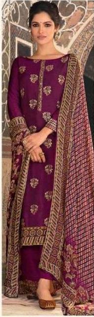
• 7982 •