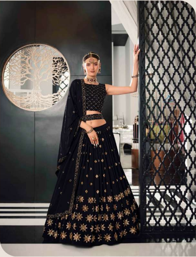
Popping up bright hues as an easy pattern with a maneuvering of delicate floral motifs - it's just the way we did it in this one.