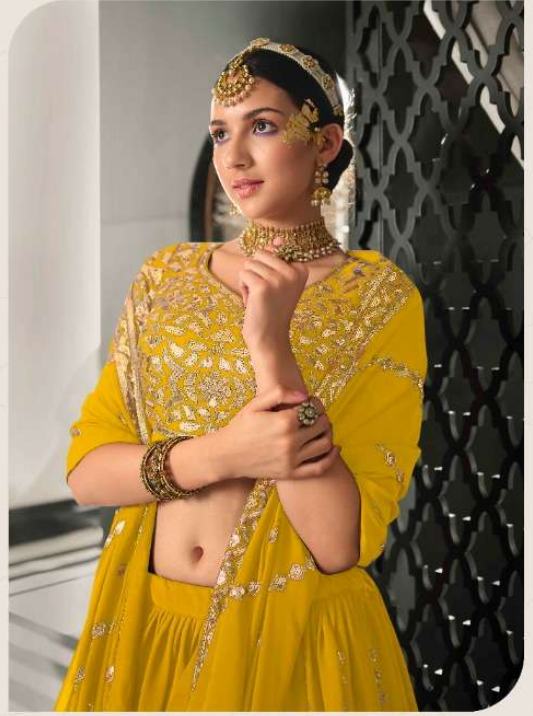
Peeping up bright hues on an eerie palette with a manipulation of delicate faded motifs – it's just the old traditional charm. #2153