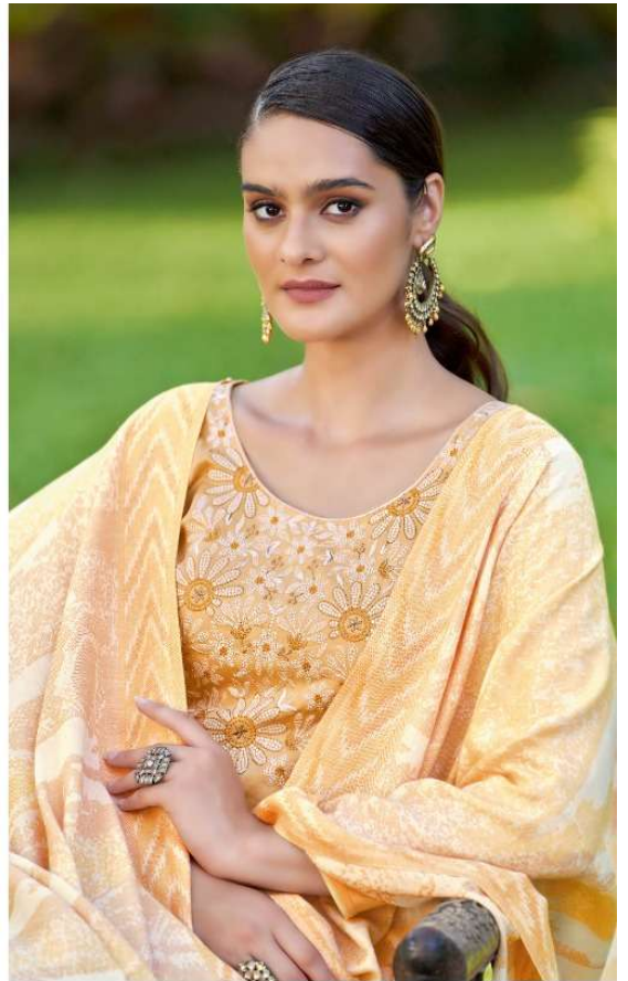
classic outfits with a twist of interesting detailing, subtle sheen, rich texture is perfectly wrapped in parache giving style a new meaning and refresh your wardrobe to Indian culture.