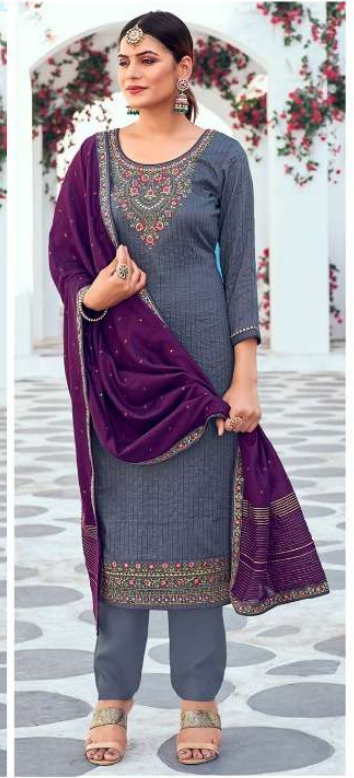
• 01034 •