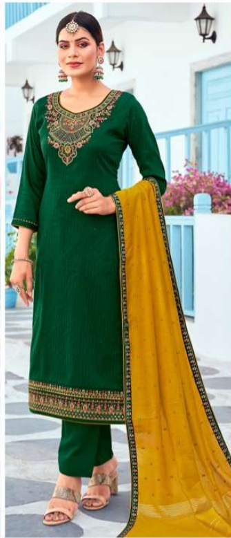
• 01032 •