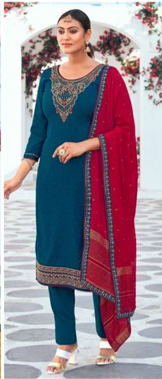
• 01033 •