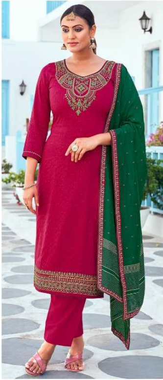
• 01031 •