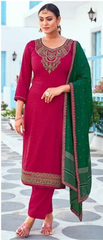
• 01031 •