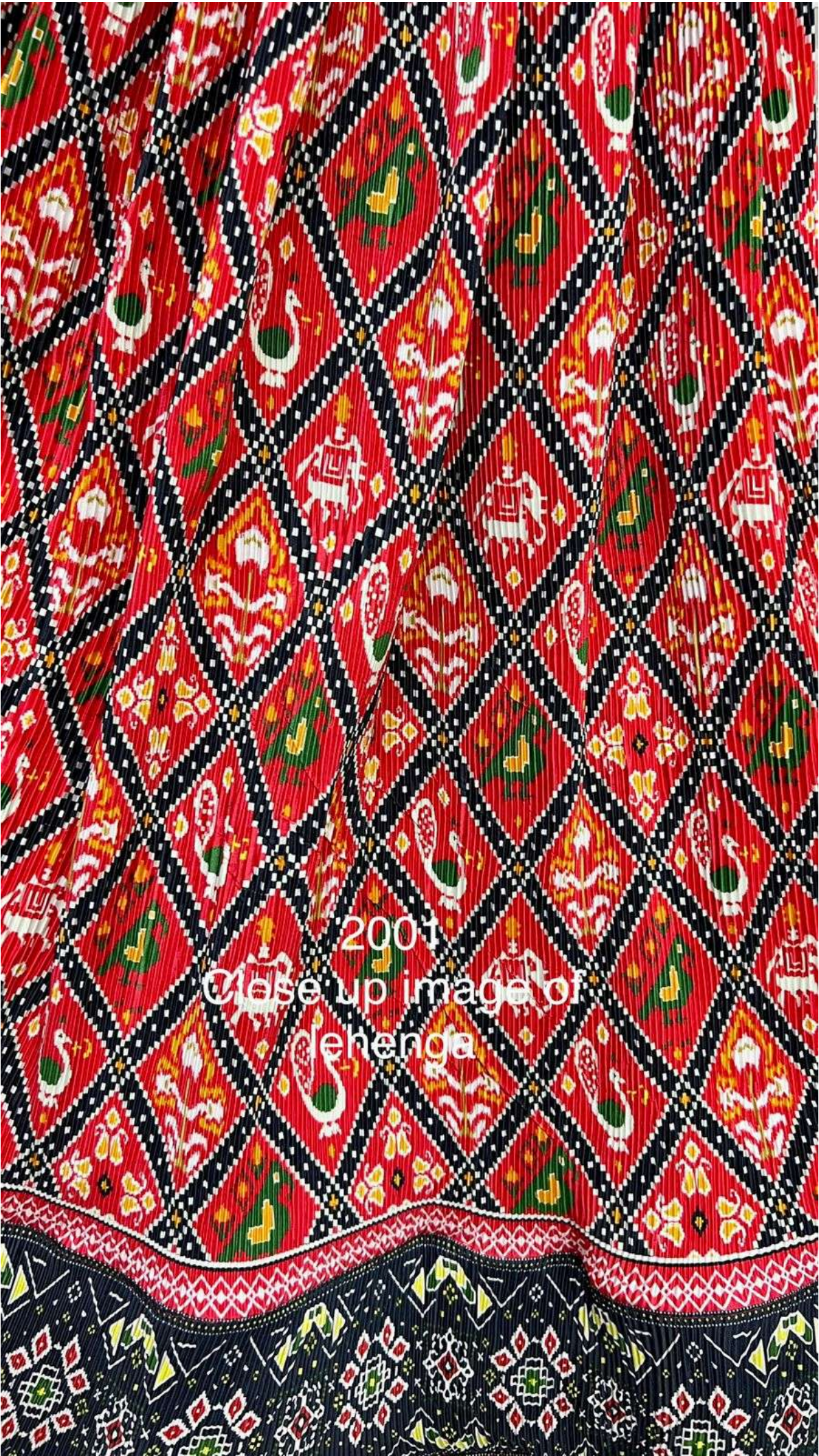
2001 Close up image of lehenga