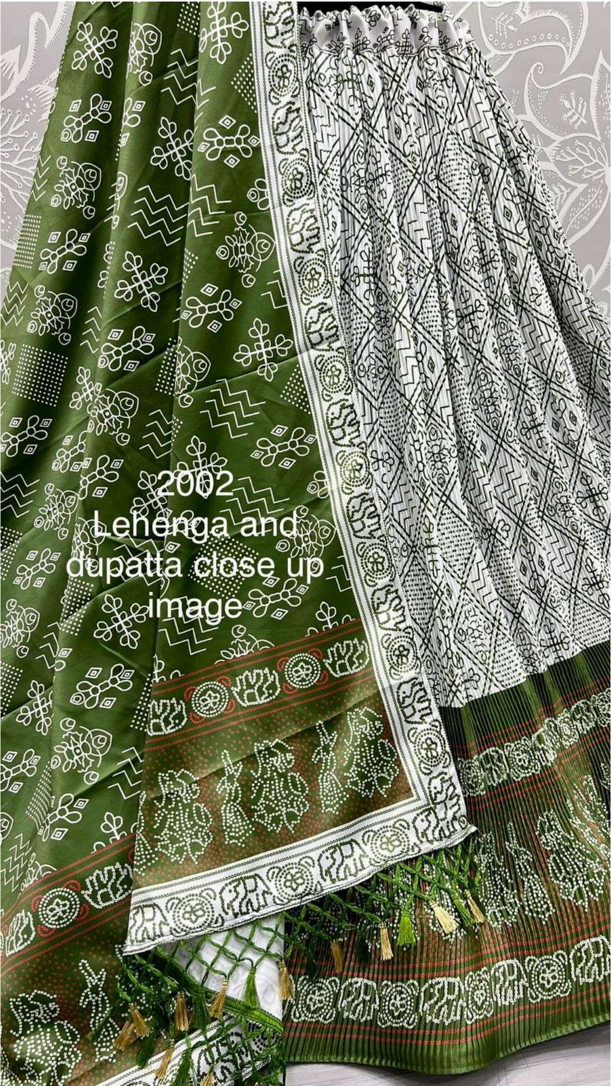
2002 Lehenga and dupatta close up image