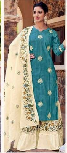
CODE | 3496