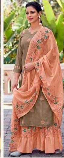
CODE | 3495