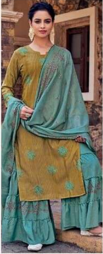
CODE | 3491