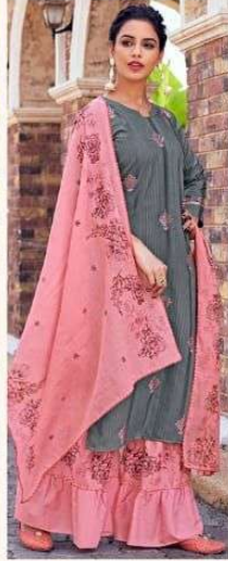
CODE | 3493