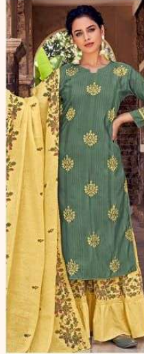
CODE | 3494