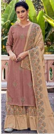
CODE | 3492