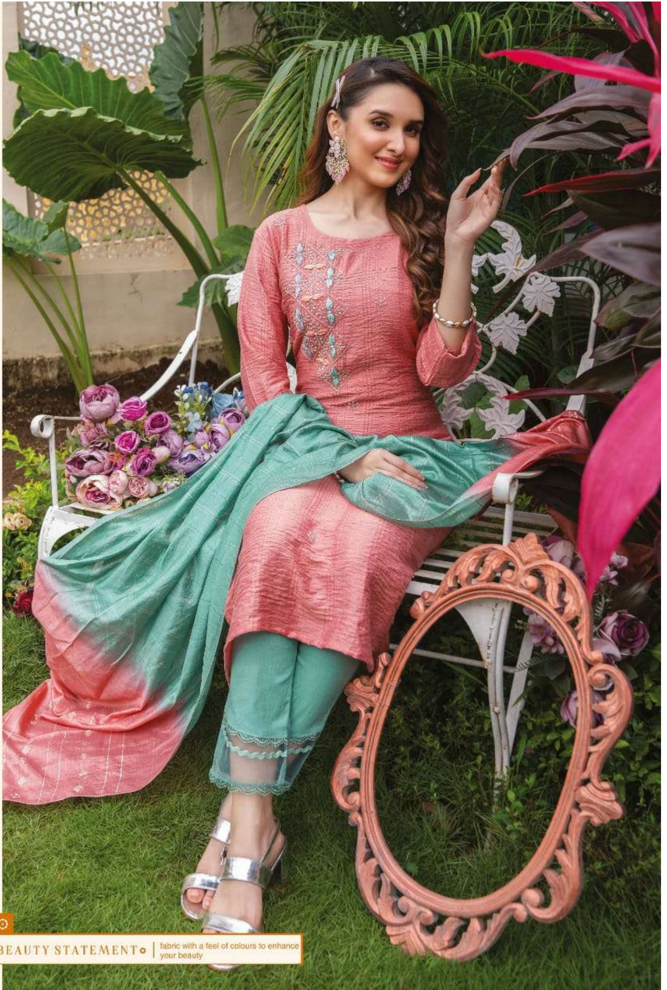
◦ BEAUTY STATEMENT ◦ | fabric with a feel of colours to enhance your beauty