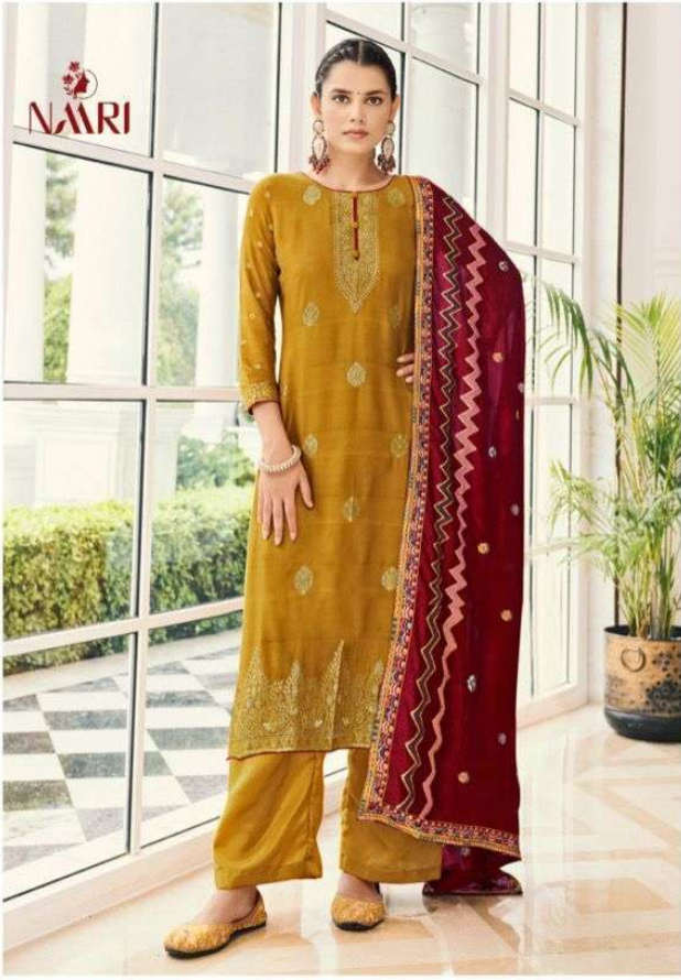
TUNE WITH SENSES THIS SEASON. D.No.084