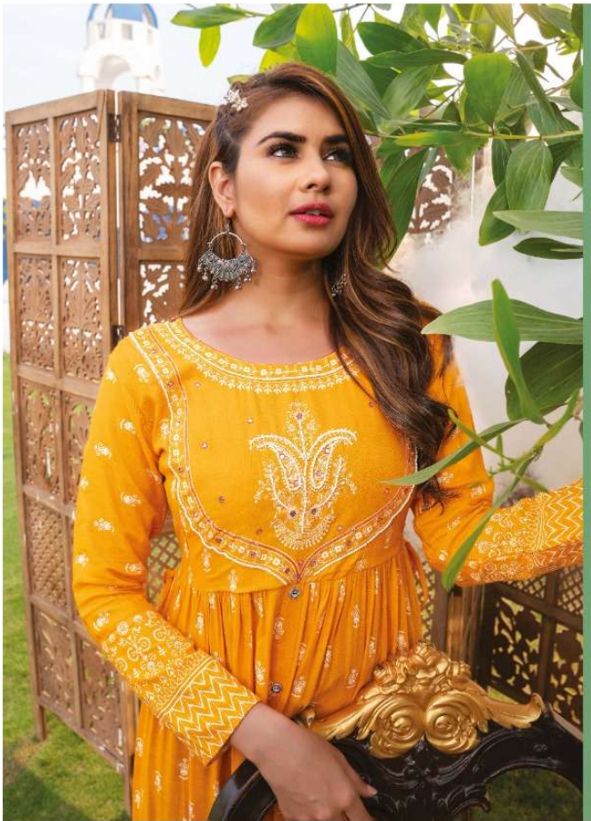
• there's a new mood for women and it's full of sophistication glamour and seductive womanly charm.