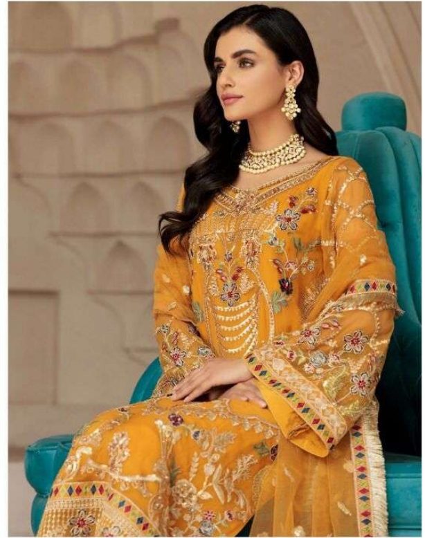
D.NO.130 TOP:- GEORGETTE INNER:- SANTOON BOTTOM:- SANTOON DUPATTA:- NET