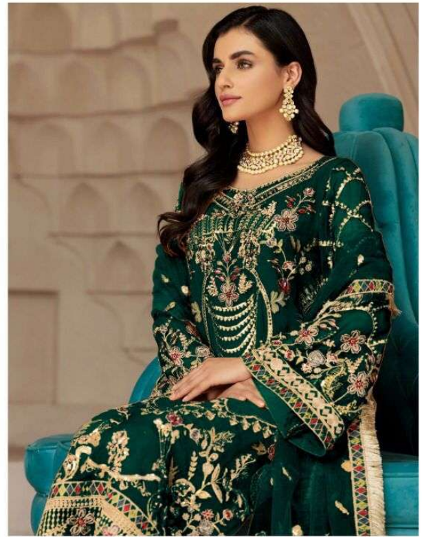
D.NO.130-A TOP:- GEORGETTE INNER:- SANTOON BOTTOM:- SANTOON+ PATCHWORK DUPATTA:- NAZNEEN