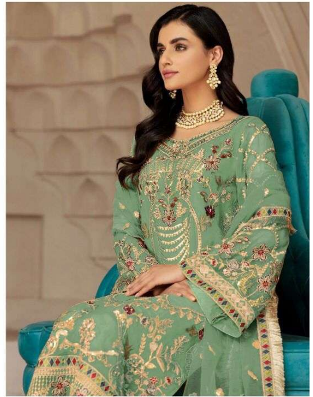
D.NO.130-B TOP:- GEORGETTE INNER:- SANTOON BOTTOM:- SANTOON DUPATTA:- NET