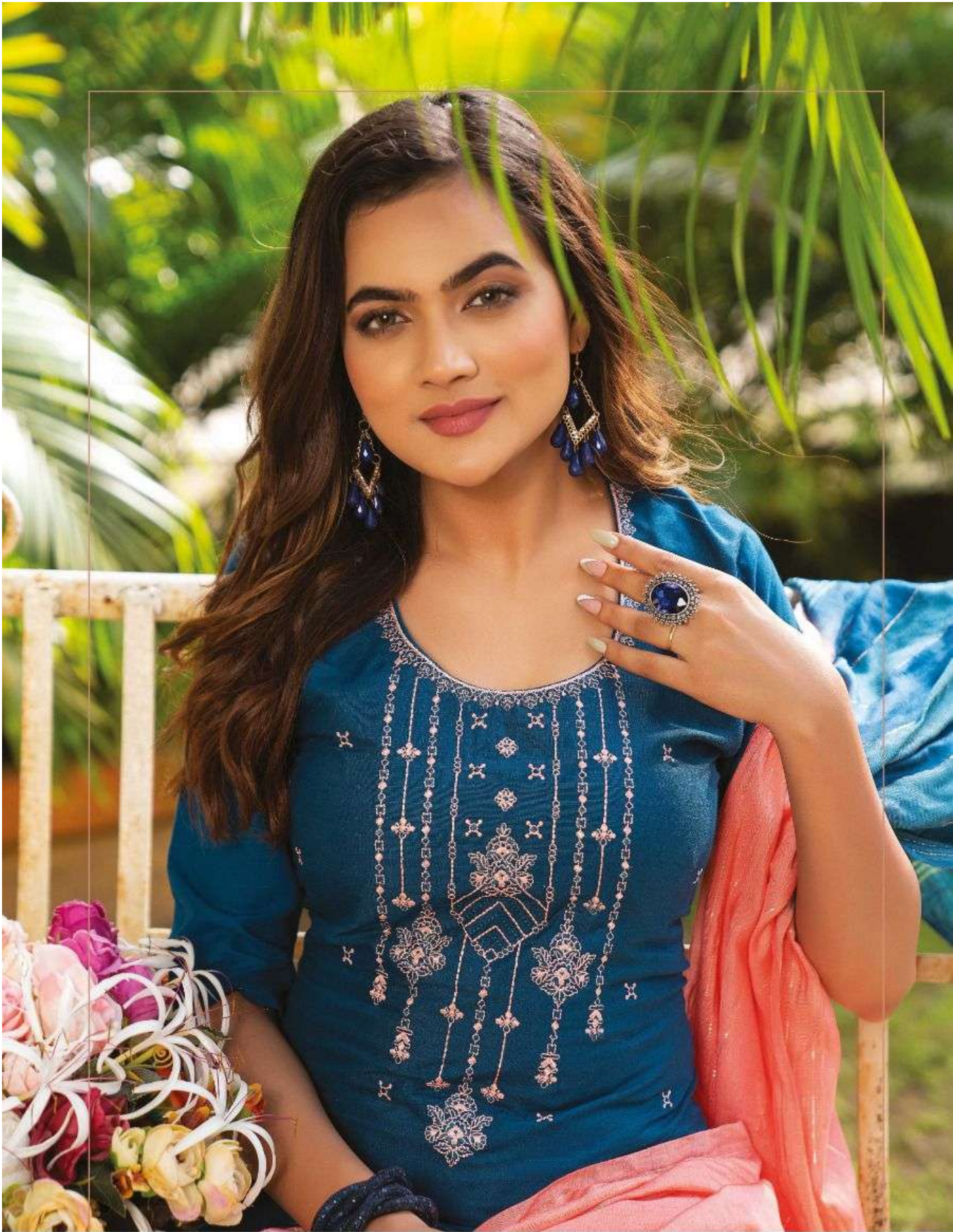
THE ESSENCE OF ART •