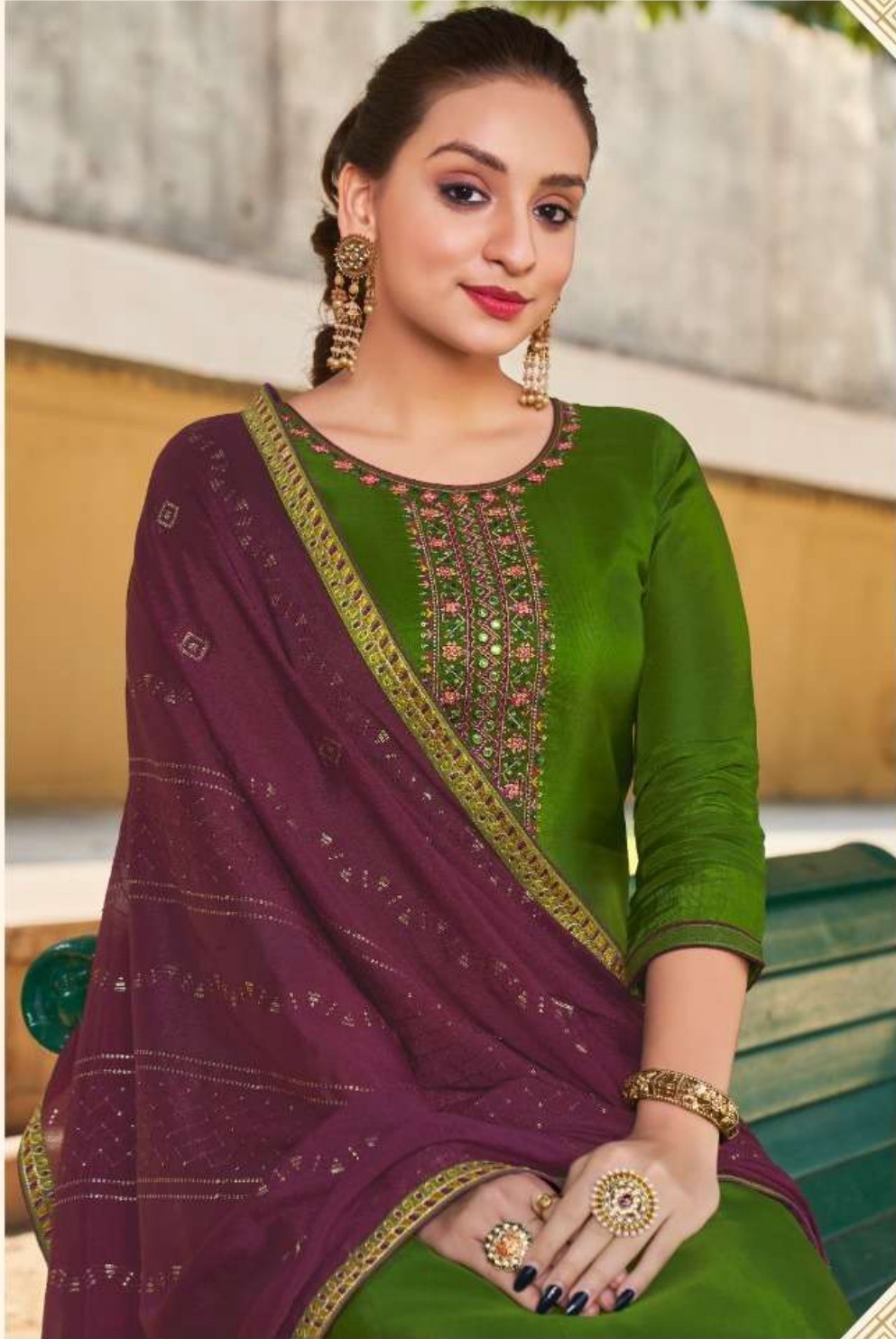
A BREATH TAKING ARRAY OF FINE DETAILING & INTRICATE DESIGN INSPIRED BY INDIAN CULTURE