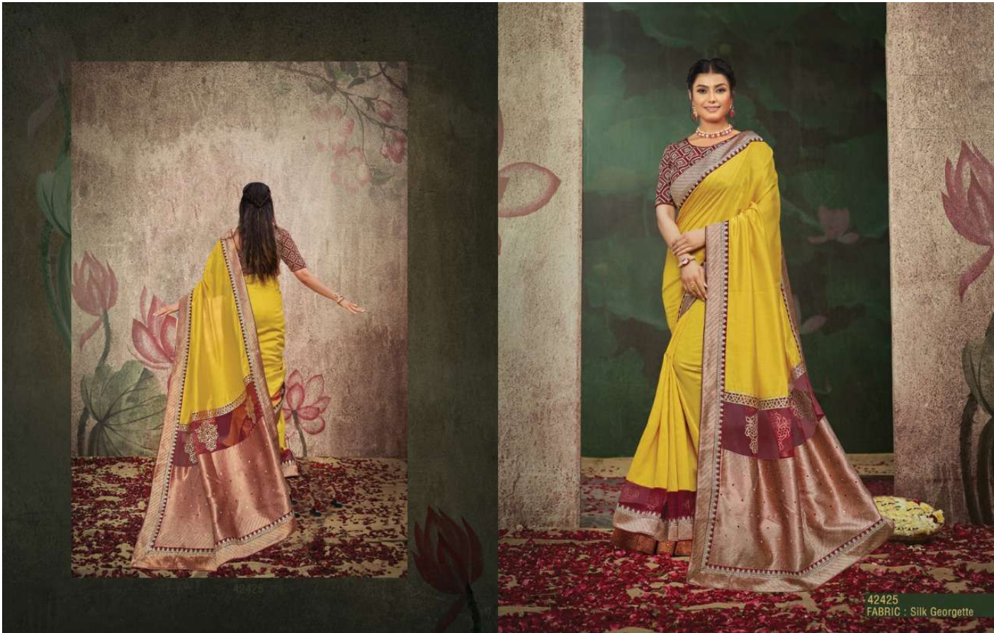
42425 FABRIC : Silk Georgette