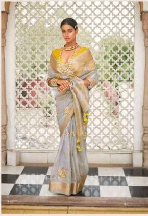
D. No. 2011