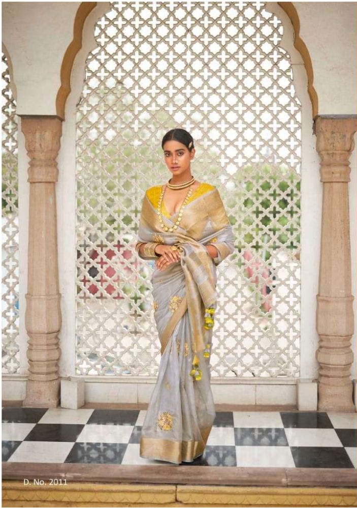
D. No. 2011