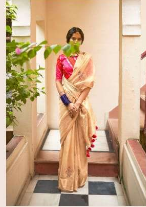
D. No. 2015

A SENSE OF VERSATILITY AND AN EPIHOME OF SERENITY