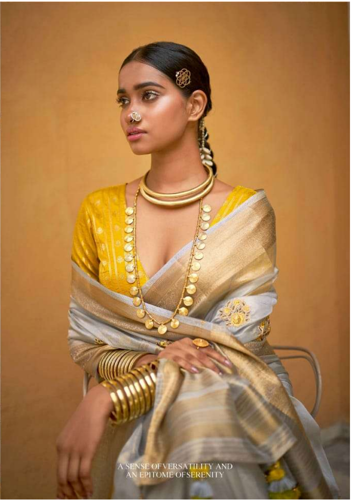
A SENSE OF VERSATILITY AND AN EPITOME OF SERENITY