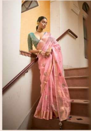
D. No. 2014