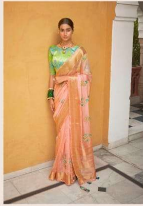
D. No. 2012