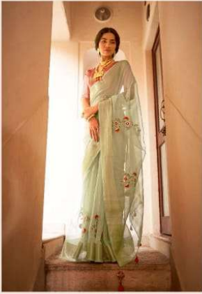
D. No. 2013