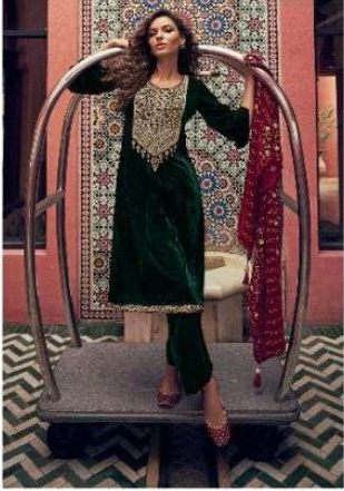
RJ | 9371