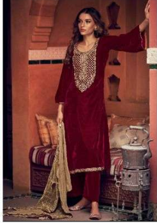
RJ | 9372