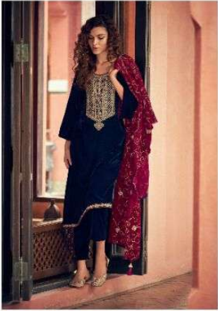
RJ | 9373