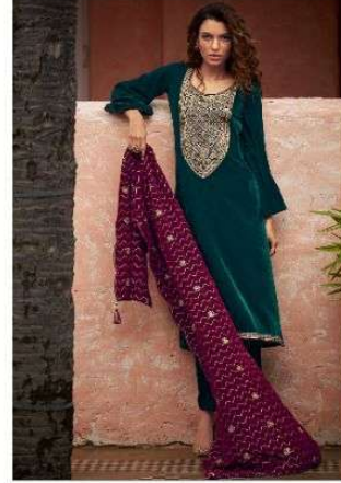
RJ | 9375