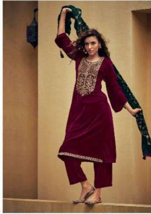
RJ | 9374