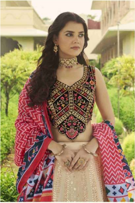
extreme beauty of delicacy 2196