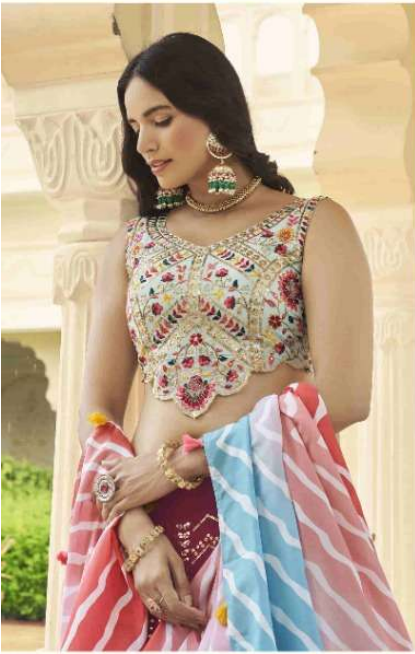
extreme beauty of delicacy 2194