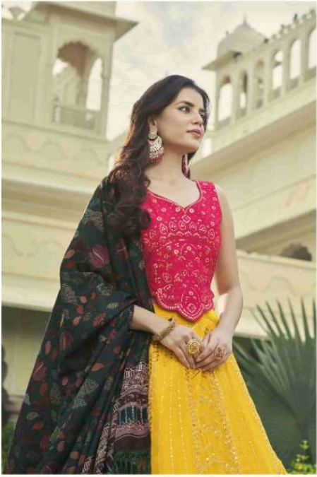
extreme beauty of delicacy 2192