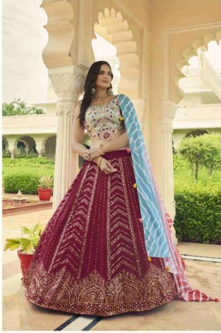
extreme beauty of delicacy 2194