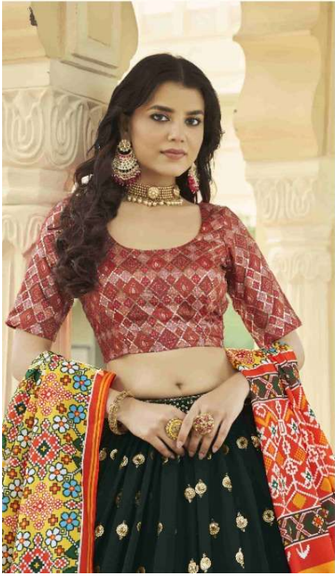
extreme beauty of delicacy 2193