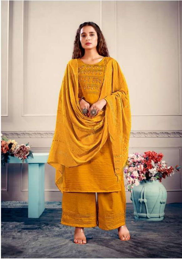
D.no . 1002