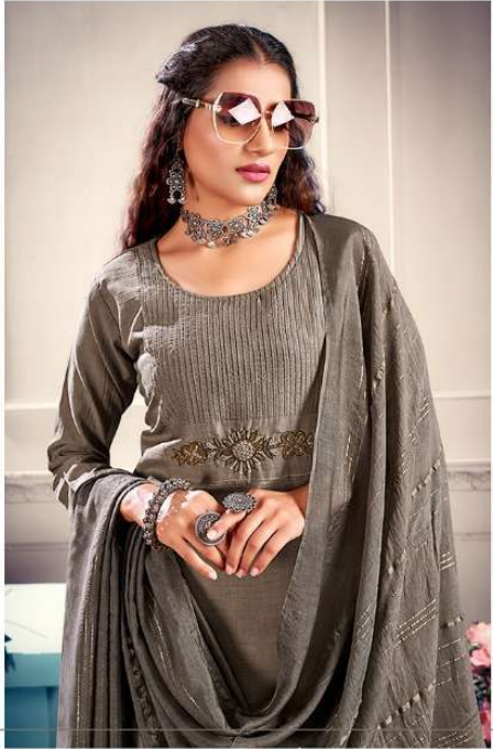
D.no . 1001