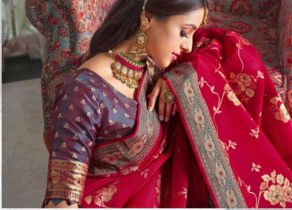
17003 • A respectable appearance is sufficient to make people more interested in your soul