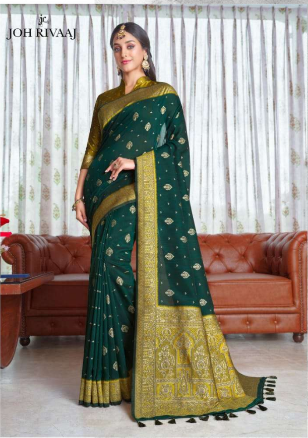
A treasured memory • 17002